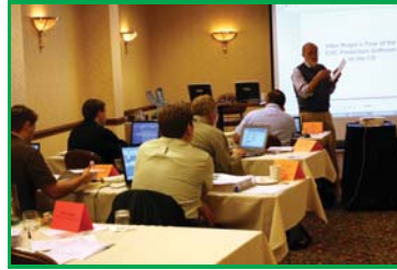
Lecture and Discussion