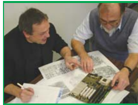
Individual EMC Design Evaluation of Your Product