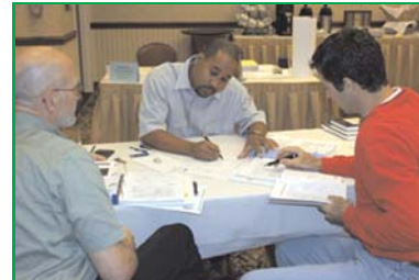
Designing a product to meet EMC compliance, Workshop - Day 3

Students will go through the product's requirements